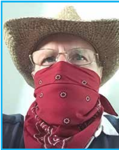
7. Exotic gourmand