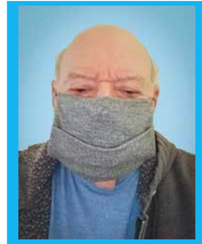
12. I'll tell you what you said!

How many of these Masked Members can you identify? Match the photo number with the member's name and Email your answers to wmsesq110@gmail.com no later than 7 p.m. on Thursday, May 21st. Winners will be announced in the next issue of Senior Moments along with more photos and a new contest. The first member Emailing the correct answers will receive an Old Guard hat as a prize. ( Considering the coming of the summer sun and the prevalence of baldness in our group, I thought this would be an appropriate prize.)