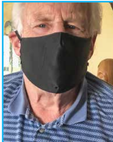
11. My lens is bigger than yours