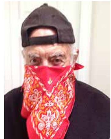
9. Birthday maestro