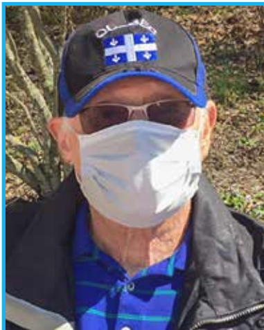
10. He sets a good buffet