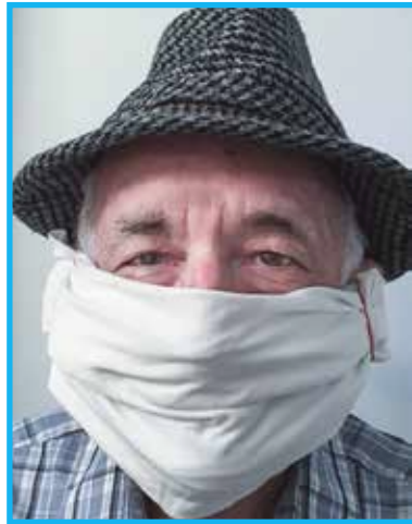
8. Artful Dodger