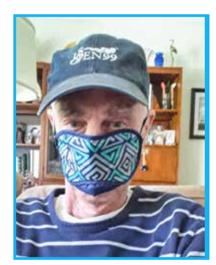
6. Chancellor of the Exchequer

How many of these Masked Members can you identify? Match the photo number with the member's name and Email your answers to wmsesq110@gmail.com no later than 7 p.m. on Thursday, May 7th. Winners will be announced in the next issue of Senior Moments along with more photos and a new contest. The first member Emailing the correct answers will receive an Old Guard hat as a prize. (Considering the coming of the summer sun and the prevalence of baldness in our group, I thought this would be an appropriate prize.)