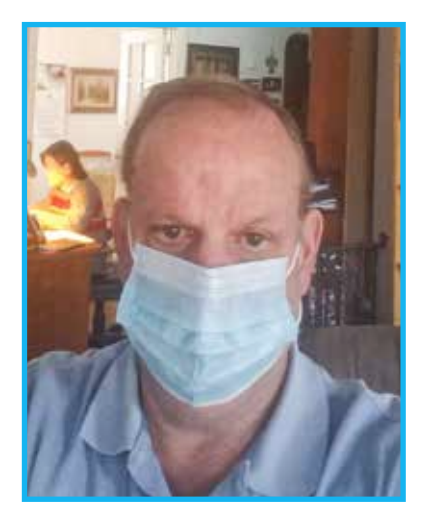
2. Purveyor of pretzels