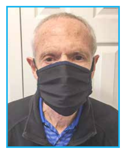
1. Sketchy guy