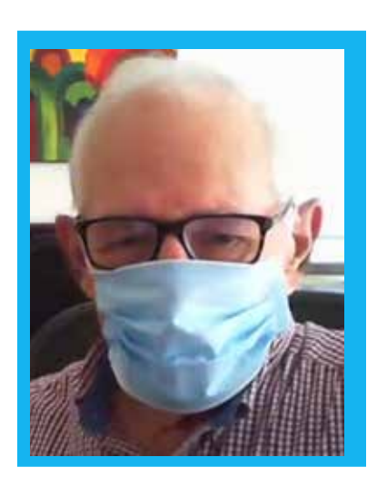
15. Has a poem in this issue!