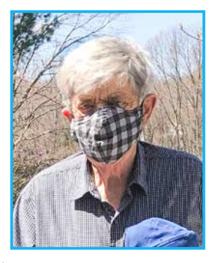
17. New Rochelle history buff