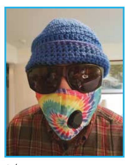
14. They named a lemon after