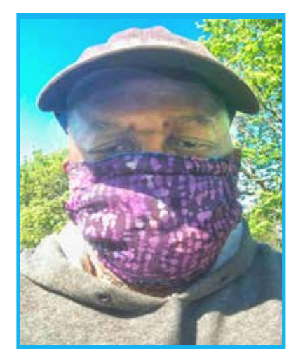
13.A driving force