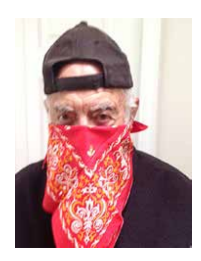
9. Birthday maestro