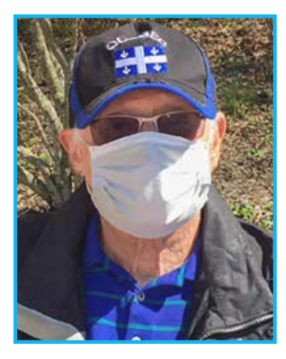
10. He sets a good buffet