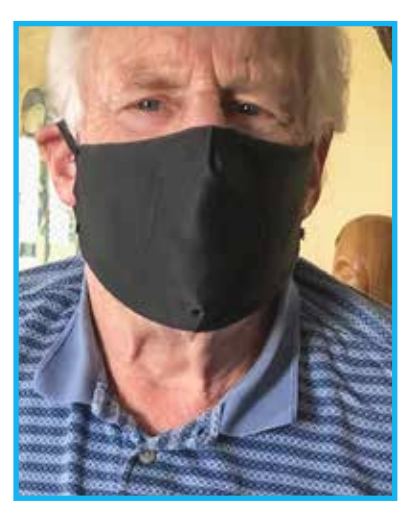
11. My lens is bigger than yours