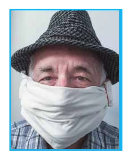
8. Artful Dodger