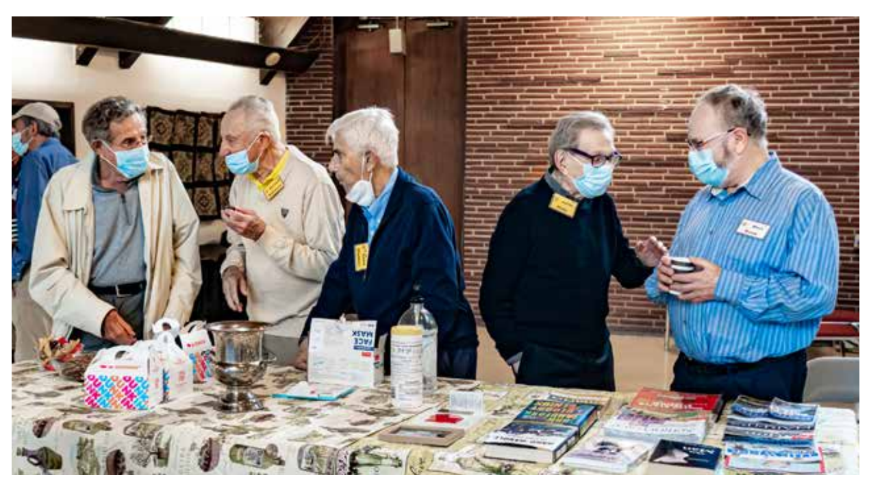
WE ARE BACK AGAIN! IN PERSON MEETINGS RESUME. Hot coffee and donuts were eagerly shared at our first live meeting in over a year.